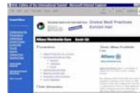
Visit Web Exhibits