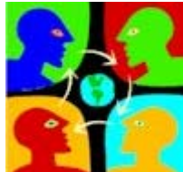
e-Network with Faculty & Attendees