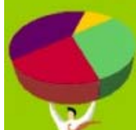
Take e-Surveys and see results