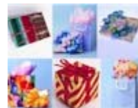
Click to win prizes